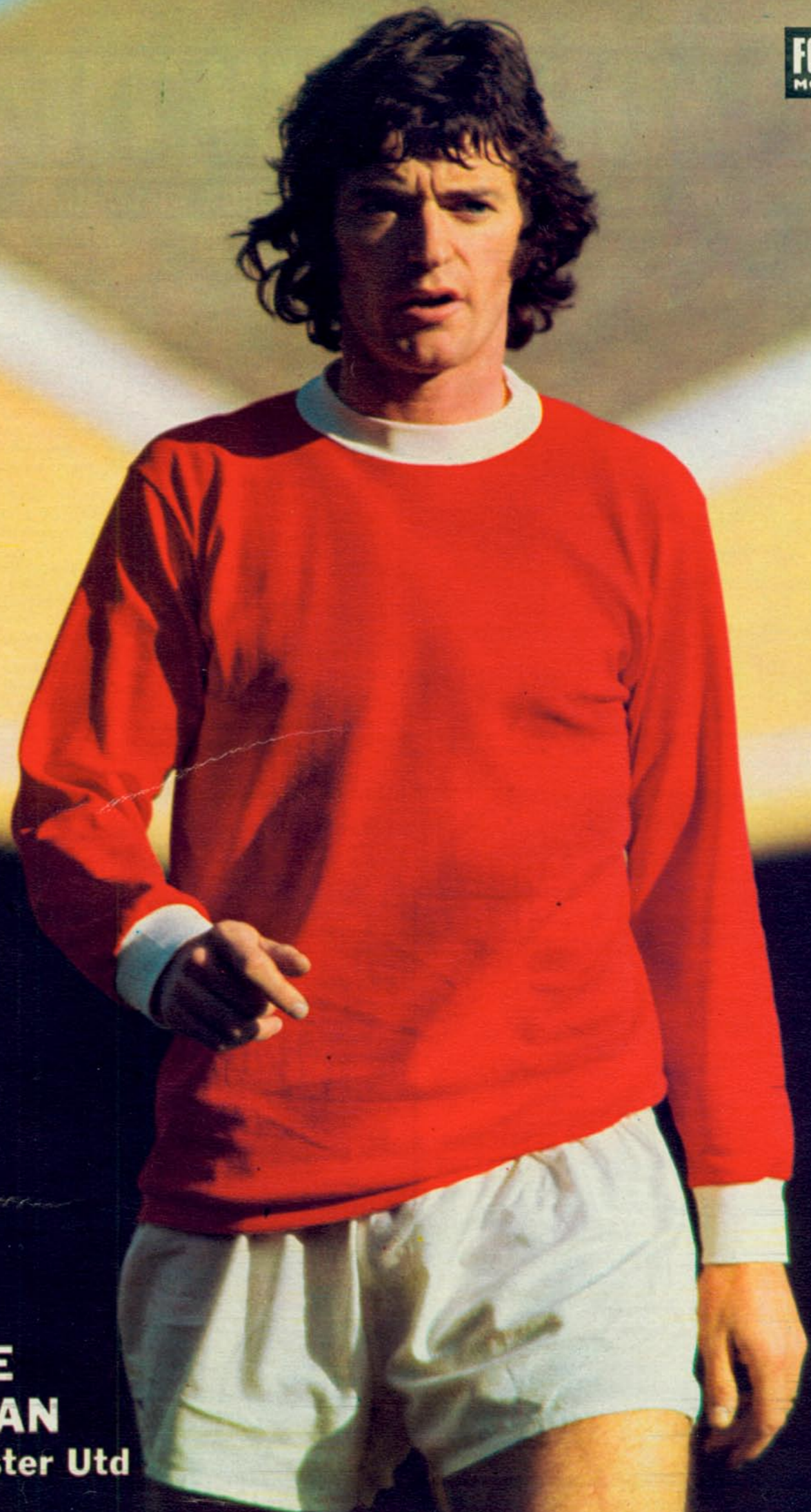
WILLIE MORGAN Manchester Utd